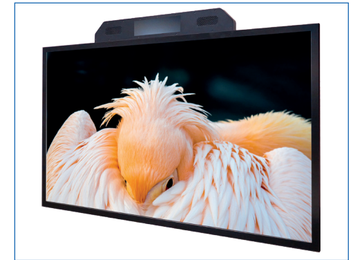
Monitor PLUS-Line 55 front view