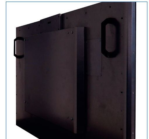
Backside and a view of small design of PLUS-Line 55.